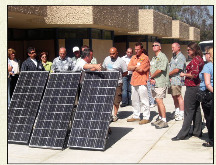
Solar panel training