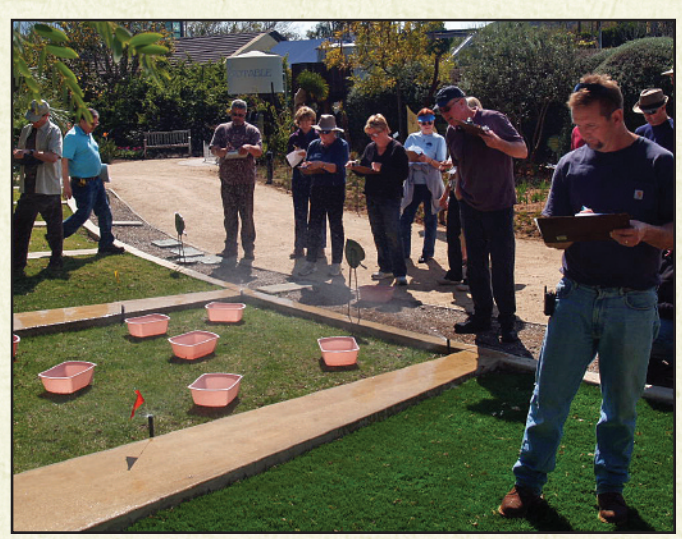
Water Conservation training