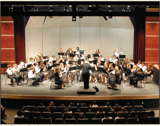
Hosting a regional music event